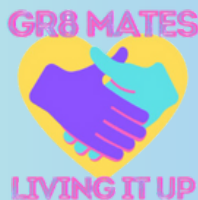
Gr8 Mates Staff and Volunteers