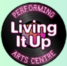
PAC Staff and Volunteers